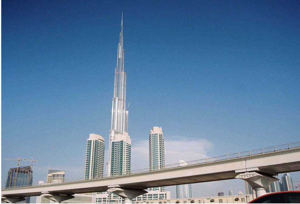
Burj Khalifa, Dubai, United Arab Emirates