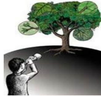
Taking a closer look

Our research in the 4 th Edition study showed that the 2011 global market for flowmeters was nearly US$5.7 billion. That's a big market! In order to make this market more understandable, we have divided it into three flowmeter groups: New-Technology, Traditional Technology, and Emerging Technology. From there, we look at each of the flowmeter technologies individually. Then we built up the total market from the individual flowmeter types.