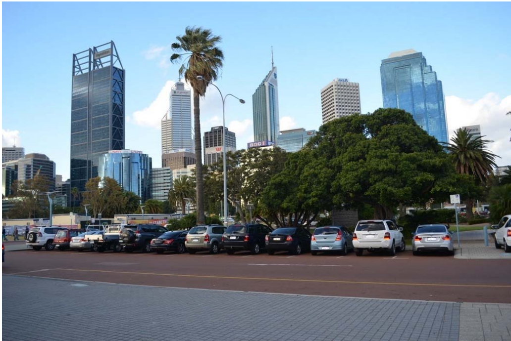
Downtown Sydney, Australia