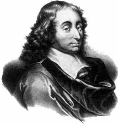
Blaise Pascal – philosopher, inventor, mathematician, writer

Flow Research instituted the Founding Sponsor Program to produce studies that most closely match our clients' needs. This program enables companies who wish to participate at a high level in a study's research to influence its scope and segmentation. In addition, Founding Sponsors receive regular updates from Flow Research on study progress, and receive a significant discount on the regular price of the study.