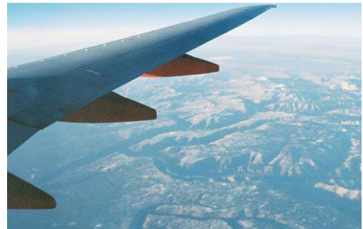
The view from 20,000 feet

Now you can profit from comprehensive market research on the worldwide flowmeter market – all in one place. The World Market for Flowmeters, 5 th Edition , presents a complete picture of the worldwide flowmeter market. This study includes both new-technology and traditional technology flowmeters, as well as the emerging flow technologies of sonar and optical. This full-color 724-page study includes: