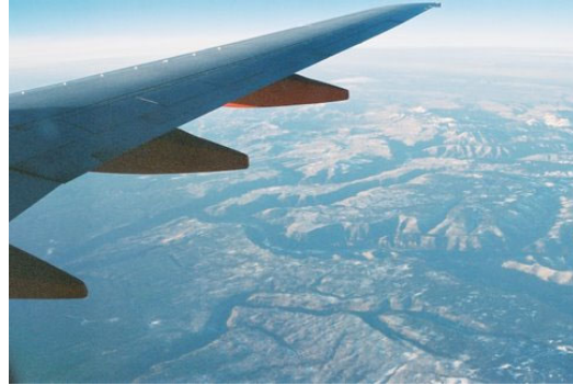
The view from 20,000 feet

We believe the better information, the better the decision – and Flow Research has always been a source of reliable, accurate data that companies can trust. This study will quickly bring you up-to-speed on the global flowmeter market and its many components.