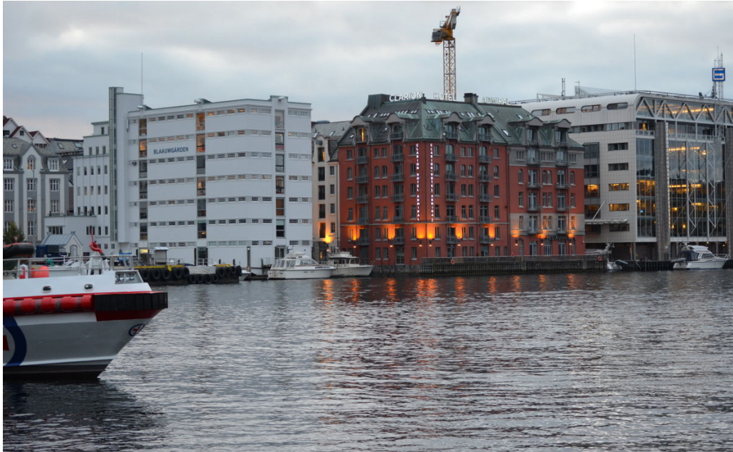
Bergen, Norway