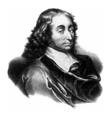
Blaise Pascal – philosopher, inventor, mathematician, writer

It's not too late to become a Founding Sponsor for Volume X: The Worldwide Market for Flowmeters, 3^{rd} Edition – or our other upcoming studies – and enjoy a significant discount.