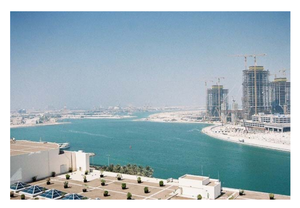
Rotana Beach, Abu Dhabi