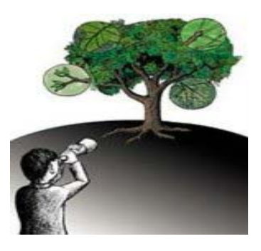
Taking a closer look

Our research shows that the 2007 global market for flowmeters was just over US$4.5 billion. That's a big market! In order to make this market more understandable, we have divided it into three flowmeter groups. From there, we've looked at each of the flowmeter technologies individually. Then we've listened to what our clients have told us is the most important market segmentation for each technology.