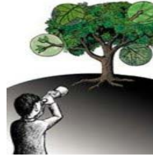
Taking a closer look

When we published our first Volume X study, we found that the worldwide flowmeter market equaled US$3.1 billion in 2002. It has continued to grow from this time until today. In order to make this market more understandable, we divide it into three flowmeter groups: New-Technology, Traditional Technology, and Emerging Technology. From there, we look at each of the flowmeter technologies individually. Then we build up the total market from the individual flowmeter types. This technique gives you a comprehensive view of the parts and the whole.