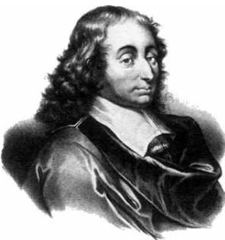
Blaise Pascal mathematician, inventor, philosopher, writer

Flow Research is introducing the Gold Partner (formerly Founding Sponsor) Program to produce studies that most closely match our clients' needs. This program enables companies who wish to participate at a high level in a study's research to influence its scope and segmentation. In addition, Gold Partners can receive early study data if needed for a strategy meeting or just to get a feeling for the market. Being a Gold Partner requires making an early decision to purchase the study. However, in return, Gold Partners receive a significant discount off the regular price of the study. Payment can be made either in one amount at the beginning of the study, or split into two, with the second payment due upon delivery of the study.