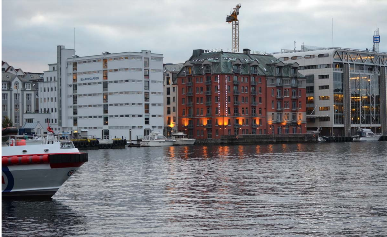
Bergen, Norway